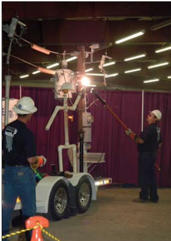
Cooperative employees present the High Line Safety Demonstration at the 2007 State Fair.

stone Energy and Discovery Channel School "Get Charged" kits will be distributed to teachers who pre-register their 5 th -9 th grade classes for the demonstration. Kansas' Largest Classroom is a one-of-a-kind educational event that features items from animals to agriculture to crafts and cowboys. The program provides teachers with such materials as lesson plans and lists of activities for a fun and exciting trip to the Kansas State Fair.