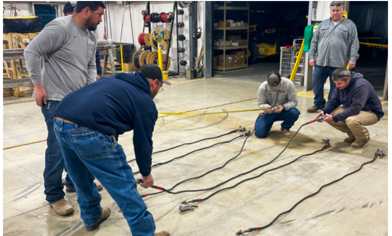
ABOVE: Our Olmitz crew inspects and measures the length of each ground chain before testing.

It's just one more way Western Cooperative Electric works behind the scenes to keep safety at the center of everything we do.