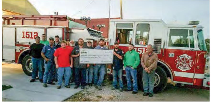
Olmitz Fire Department received a $2,800 Sharing Success Grant, to help equip their new brush truck.