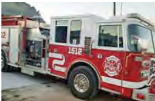
This fully-equipped brush truck was added to fleet at Olmitz Fire Department to serve the community.

"This donation allowed the Olmitz Fire Department to not only equip the third truck, and be prepared, but also have equipment available for assistance to departments needing mutual aid," said Fire Chief New.