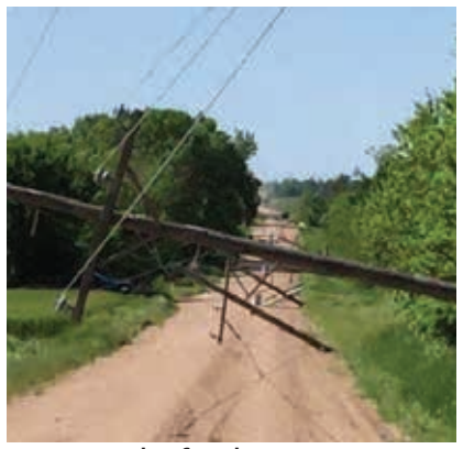
Just two weeks after the winter storm, a tornado caused outages to 900 meters.