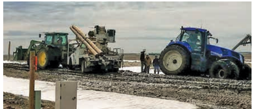
Members were essential in the storm restoration using tractors to pull along digger trucks stuck in the deep mud.

"Winter Storm URSA" pelted Western Cooperative Electric members with more than a foot of snow, causing extensive damage in Sheridan and Gove counties the last weekend in April. In the initial aftermath, more than 2,000 services were without power, caused by damage to more than 600 poles and nearly 160 miles of line.