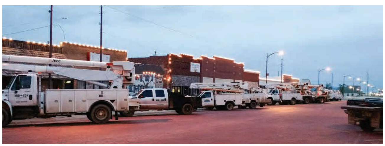
Mutual aid crews lined Main Street in WaKeeney ready to help restore power to Western's members.