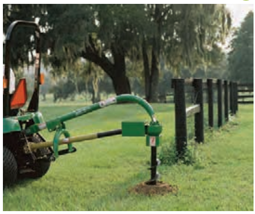
If any of your projects require digging—such as planting trees or setting posts—remember to dial 811 first!

the Common Ground Alliance (CGA), a federally mandated group of underground utility and damage prevention industry professionals. CGA data also shows that an underground utility line is damaged every six minutes in the U.S. because someone decided to dig without first dialing 811.