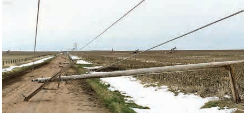
Nearly 600 poles were damaged by the storm in rural Gove and Sheridan counties.